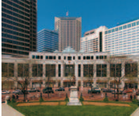
WellPoint Inc. is the largest health care benefits company in the nation.

The Region offers a variety of opportunities for executive living, including university settings, quaint neighborhoods, vibrant up-scale urban districts, spacious lake-front homes and peaceful rural towns. Plus there's affordable housing for workers, all within a few minutes of work and recreational activities. Indianapolis is the number one city in the U.S. with a population of more than one million in terms of housing affordability. With the sale price of four bedroom houses averaging